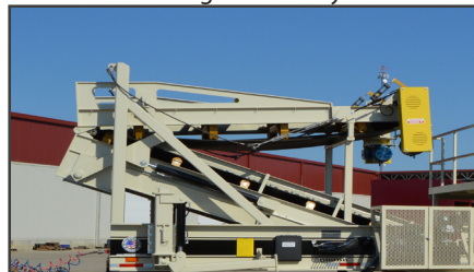
54" Discharge Conveyor Kingpin End Discharge