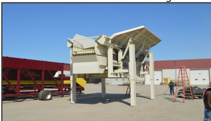
Lift Off Hopper and VGF Module

*NOTE: Listed weights are not exact. Actual weights will vary based on screen size, brand, options, etc.*