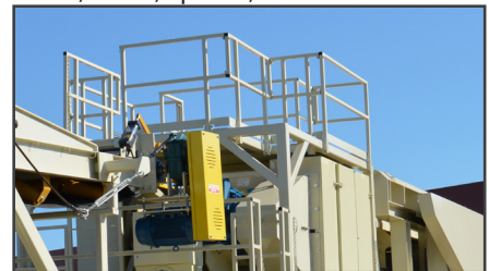
Upper and Lower Platforms Double Handrails and Kickplates